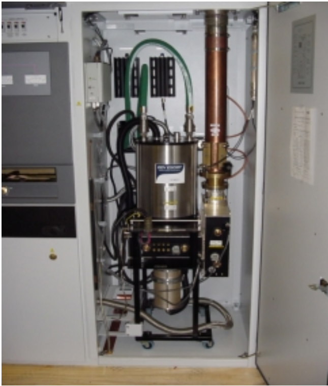
Photograph 1 – The e2v ESCIOT installed in the Ai Quantum HPA

coolants and it is widely available. It is historically the standard choice of tube and transmitter designers and it provides the benchmark against which other coolants must be measured. The dielectric isolation is easily provided by the incorporation of a de-ionizing loop and freeze protection can be designed into the cooling system. Many millions of operating hours have been accumulated using de-ionized water in high power transmitters worldwide, in a broad variety of environmental conditions. Of significance is the fact that all MSDC klystrons use de-ionized water, (ref 1). The analysis of the lives of these devices indicates that the average life is higher than their non-depressed klystron brethren. There could be a number of reasons for this fact, but it is generally accepted that the use of pure water is a major contributor to the extended lives.